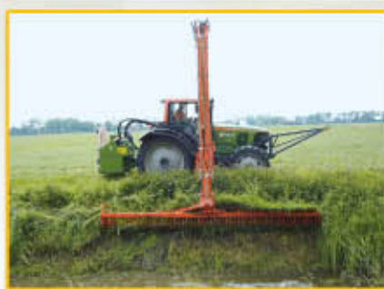
Grenadier MBK512LS with mowing bucket 5.5 mtrs