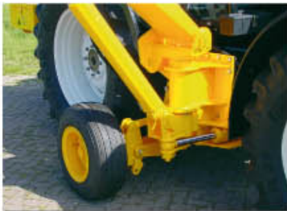
Supporting wheel instead of supporting plate