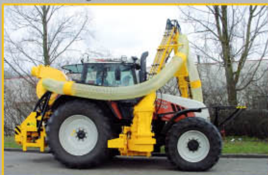
Slewing rim will be used to enlarge the slewing reach