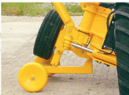
Wheel set for (de-)mounting