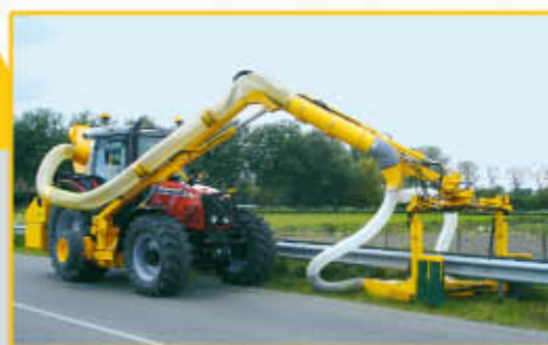
Grenadier MBKA513 with guard rail mower and suction unit