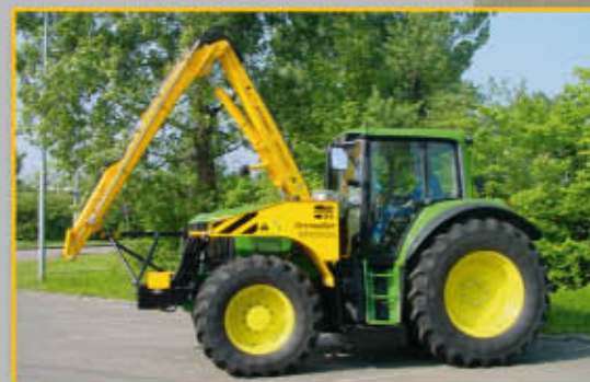
Due to permanent mounting the lifting device will kept free