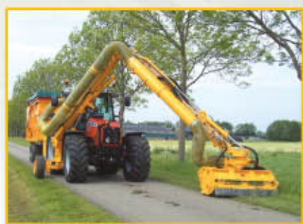
Grenadier MBKA513S with Eco mower and suction unit

A professional HERDER® machine which will be the best choice for every target group. The new 2 handle control will give the driver an ergonomic well considered posture during work