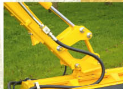
Tumbling piece on boom 2