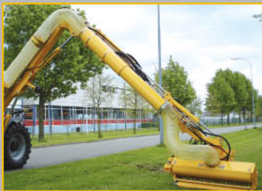
An extending suction hose will be used in case of an extending boom

Hydraulic QD fast connecting system for the (de-)mounting