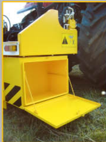
Tool box and lightning are standard accessories