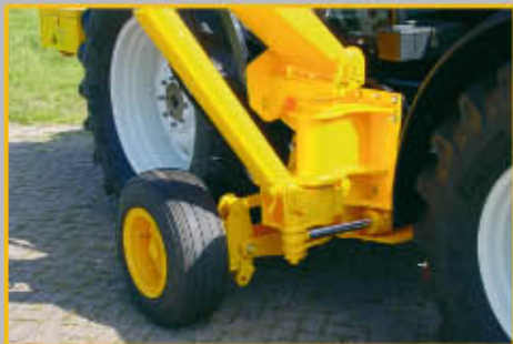
Supporting wheel instead of supporting plate