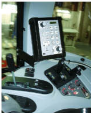
The compact control box can be placed everywhere in the cabin