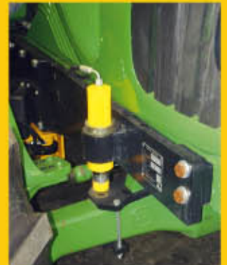
Standard stabilization cylinder