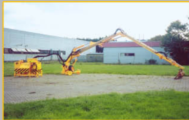
Hydraulic QD fast connecting system for the (de-)mounting