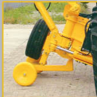
Wheel set for (de-)mounting