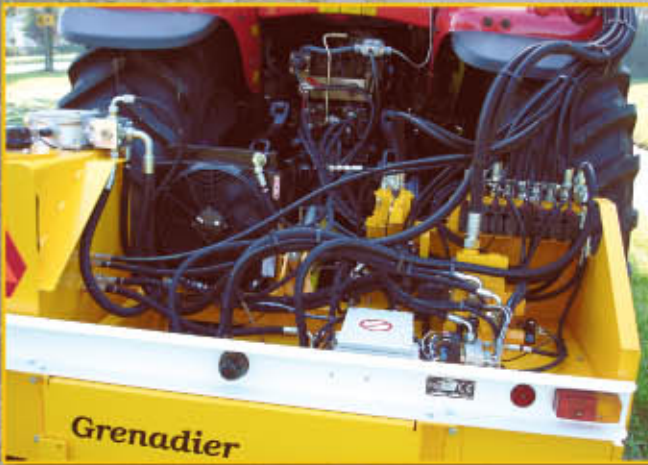
The hydraulic components can be easily reached for maintenance