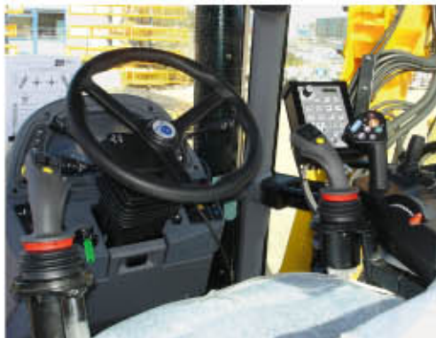
Standard electric 2 handle control Menu 1 : euro control for mowing buckets Menu 2 : one handle control to work during moving.

This menu adjustment enlarges the availability of a experienced excavator driver with a tractor machine