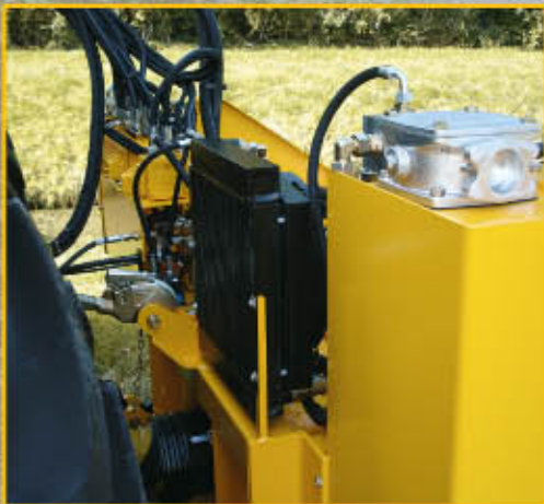
A big oil cooler of 13.2 kW will be standard