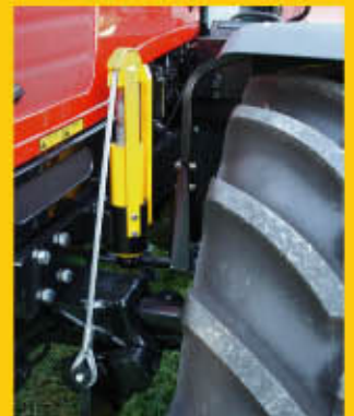
Stabilization cylinder for suspension front axle