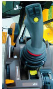
One handle control to work during moving

This menu adjustment enlarges the availability of a experienced excavator driver with a tractor machine