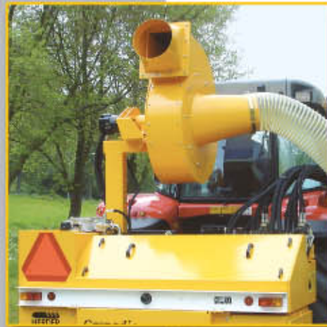
Supporting frame with suction ventilator